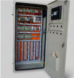
PLC CONTROL PANEL