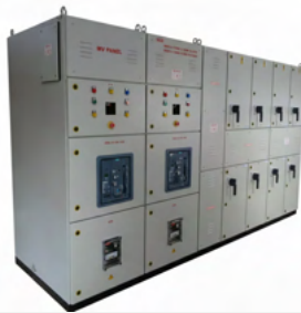
MV PANEL / LT PANEL