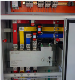
AMF / ATS PANEL