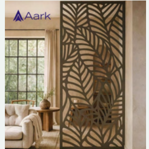
LASER & ELEVATION DESIGNS